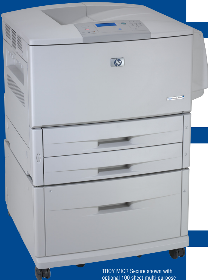
TROY MICR Secure shown with optional 100 sheet multi-purpose tray and 2,000 sheet input tray.